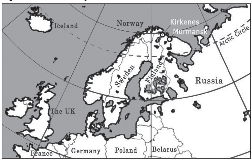
Figure 1. Northern Europe with the location of Kirkenes and Murmansk