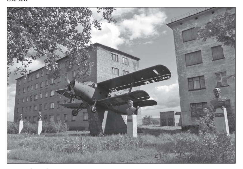
Figure 6. Monument of Soviet aviation heroes at Luostari with one Antonov An-2, the "Annushka;" a biplane utility and school aircraft designed in 1946 and in production until the 1990s. Yuri Gagarin's bust is the second from the left

aesthetics of ruins have profound significance in European culture.<sup>29</sup> The meaning and emotions of ruins are further intensified when they include neglected memorials. As these were always erected to celebrate and to fix attention on certain values their degree of decay becomes a meter of the strength of that which it is made to signify in posterity. The monuments at Luostari of Yuri Gagarin, the first man in space, illustrate the role of ruins in the stream of time.