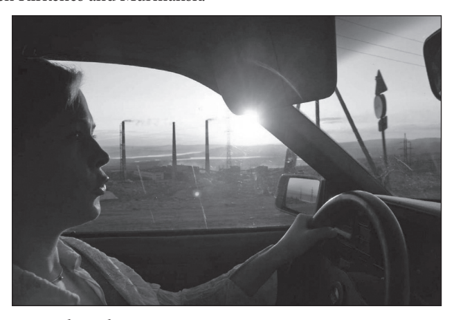
Figure 3. Driving by the industrial plant at Nikel in Russia, on the road between Kirkenes and Murmansk.

There are two sides to the identification of the Kirkenes-Murmansk borderland crossing with the road movie genre. It is useful to draw upon the scholarship of film genre analysis as an interpretative resource, but also because the road movie genre provides a meta-script which may cause factual travels to include re-enacted elements from it. A road movie simulation may determine the experiences, narratives, and knowledge of the travel; it is a hyperreality with an aesthetic logic that can be artfully enacted. In the following the re-enactment of the elements of the road movie genre will be traced in individual and group travels along the highway between Kirkenes and Murmansk. It is most likely to influence the minds and practices of travelers in small groups, taking part in non-official journeys, the constellations marked bright green in table no. 1.