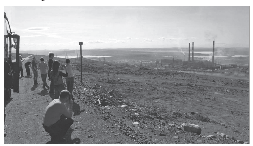
Figure 4. Photo-stop on the hill overlooking Nikel on the Kirkenes-Murmansk main road. This is the standard site for anyone in a hurry to re-enact an environmental inspection of this metallurgical combine and its surrounding wasteland

participant. In this mind-set driving by the cemeteries of Nikel mainly adds an ambiguous aura of doom.